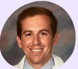
Joseph ACES Committee