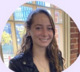
Eva ACES Committee