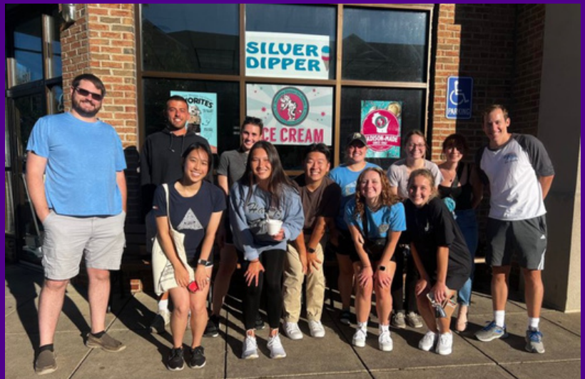
The Executive Board enjoyed an ice cream social at Silver Dipper.